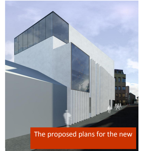
The proposed plans for the new

Please contact the team for more information: myplace.admin@valuton.org.uk