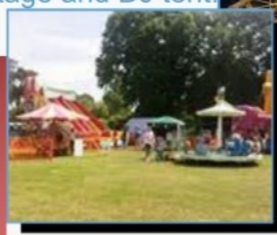
ParkFest! 4 AVS "a Party with a Purpose".

27TH AUGUST 2011 12 - 7 PM VENUE: LEAGRAVE COMMON SUNDON PARK LUTON. LU3 3BL.