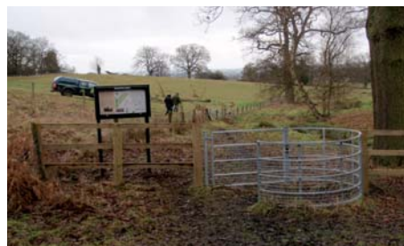
New gate and interpretation board

The works were carried out over the last year and we expect to move livestock into the two areas over the next few months.