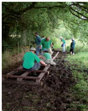
Volunteers constructing the boardwalk

The works were carried out over the last year and we expect to move livestock into the two areas over the next few months.