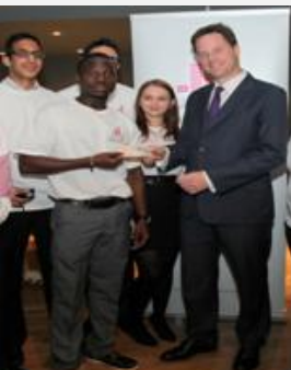
UpRising Patron Nick Clegg lending a tenner to UpRising Social Action Group